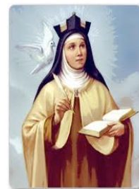
St Teresa of Avila